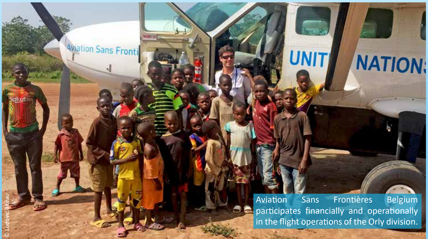
Aviation Sans Frontières Belgium participates financially and operationally in the flight operations of the Orly division.

These projects are then carried out by ASF-International and implemented by the competent