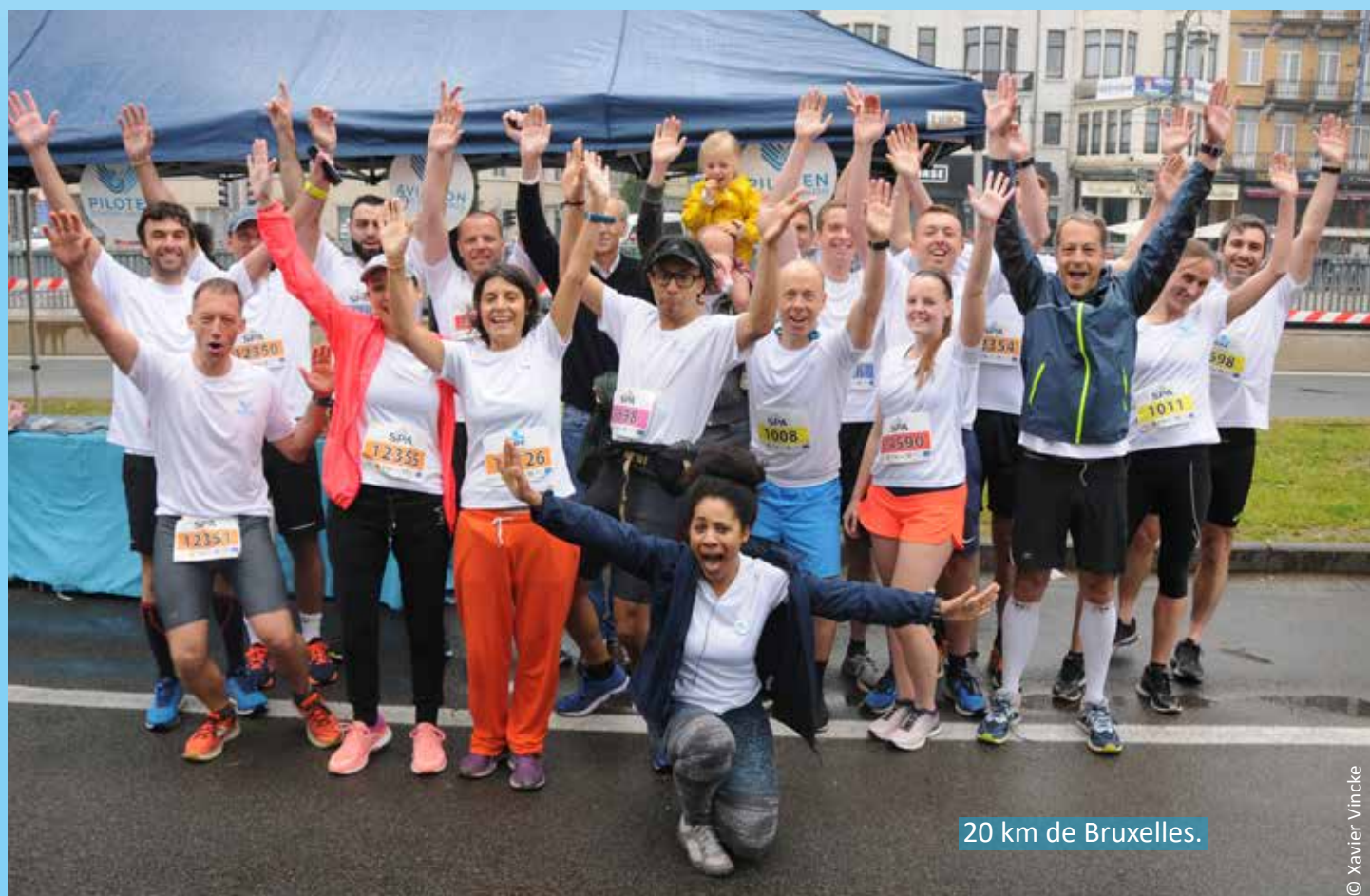
20 km de Bruxelles.