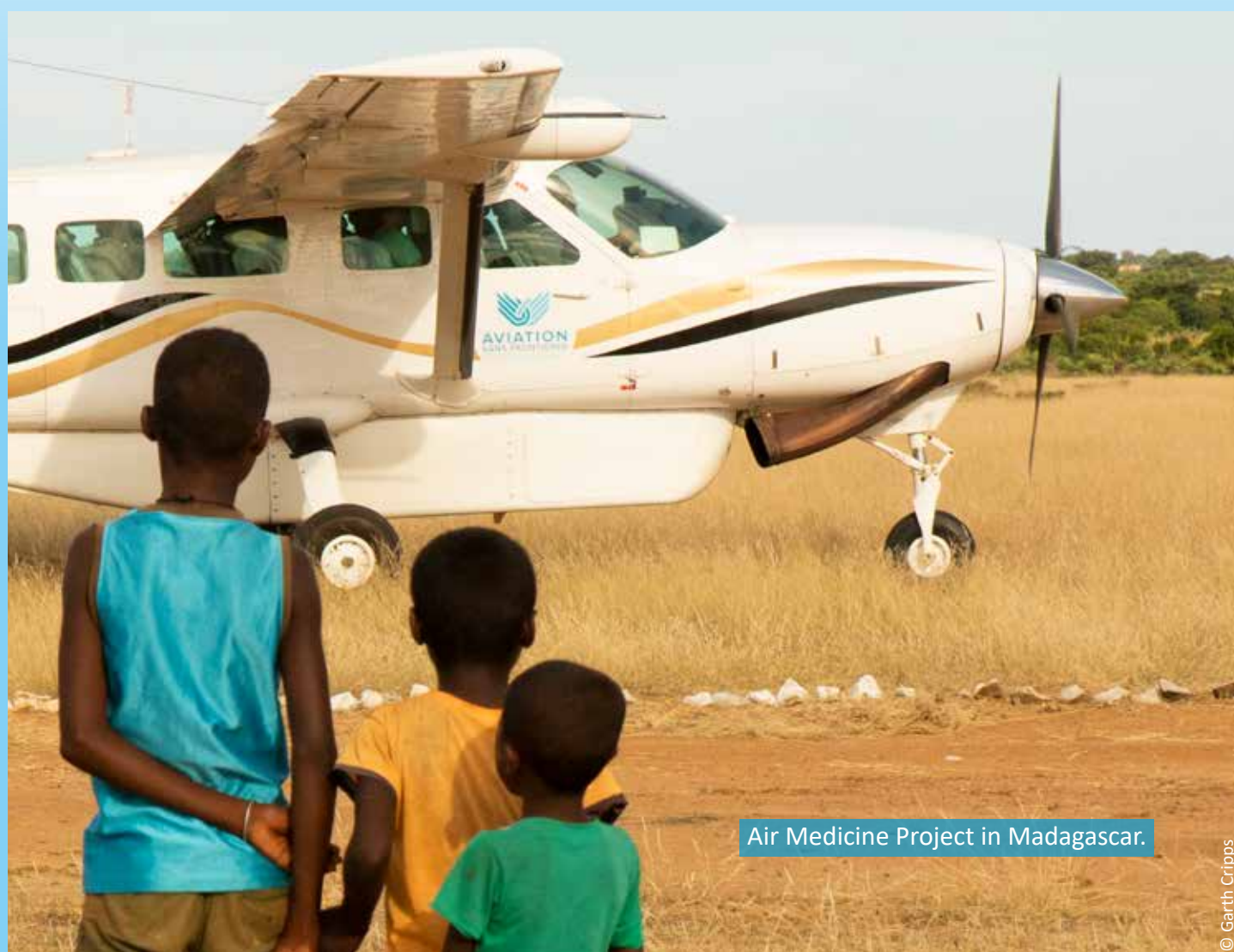
Air Medicine Project in Madagascar.