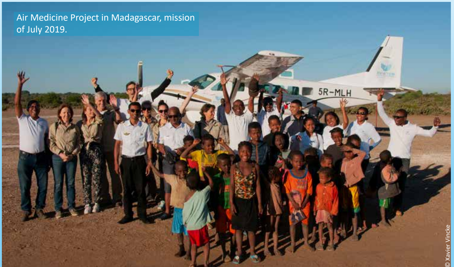
Air Medicine Project in Madagascar, mission of July 2019.

Since 2016, Aviation Sans Frontières has been supporting the NGO MEDICAERO's air medicine project. This innovative project involves flying a multidisciplinary medical team directly into contact with patients in landlocked areas of Madagascar. In addition to the provision of care and medicines, the project ensures exchanges of experience, capacity building of local staff and practical teaching of Malagasy students.