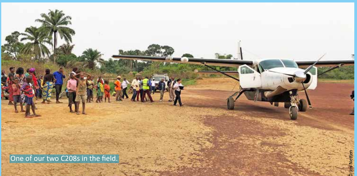
One of our two C208s in the field.

A total of 1,841 flight hours were flown from bases in Bangui (Central African Republic) and Bunia (Democratic Republic of the Congo).