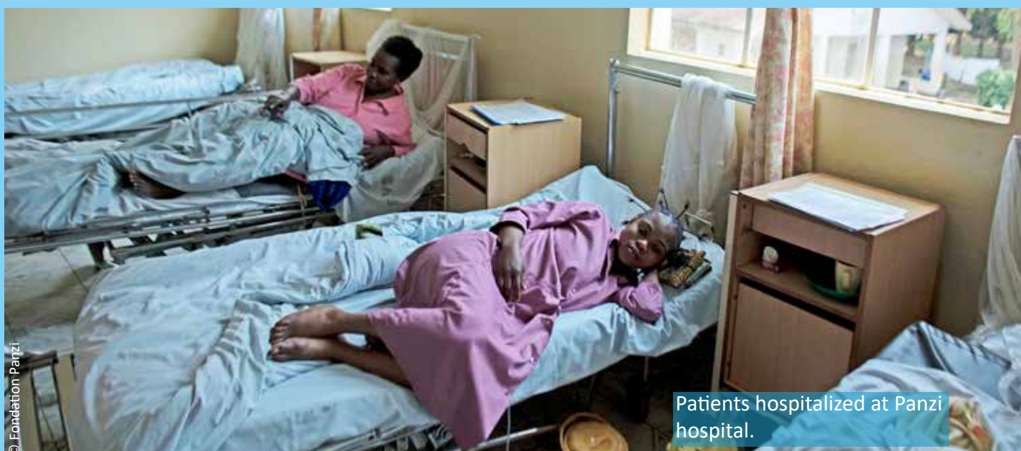
Patients hospitalized at Panzi hospital.

Dr MUKWEGE has raised the awareness of sexual barbarism suffered by women in the eastern Democratic Republic of the Congo where gang rape is used as a weapon of war. He fights at the risk of his life to put an end to this practice. For his commitment to the fight against the use of genital mutilation as a weapon of war and for his dedication to the victims of such acts, Dr MUKWEGE has received various awards, including the following: