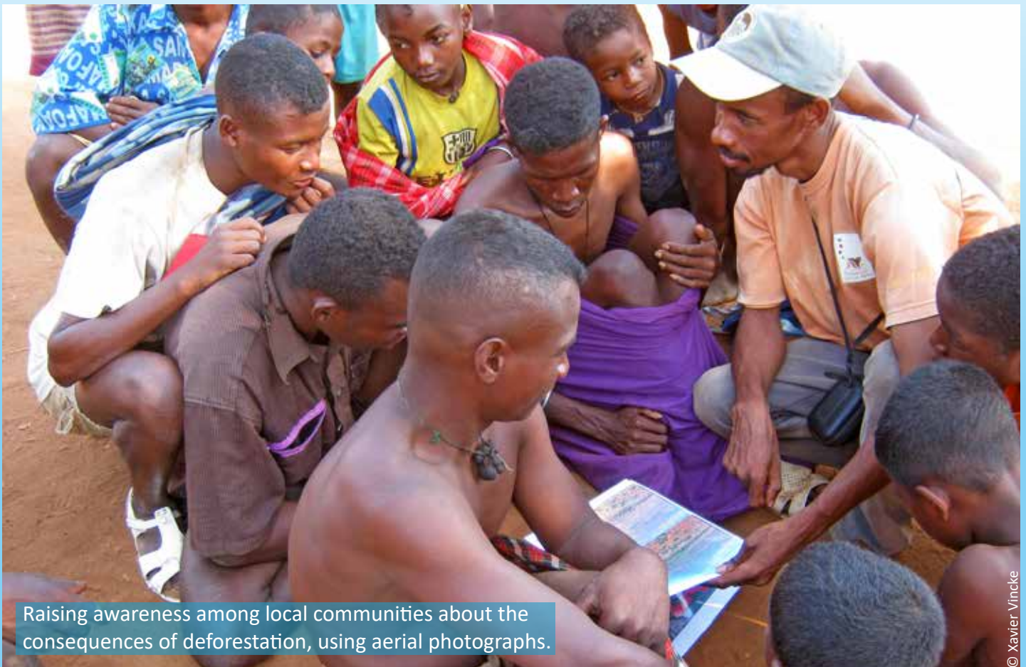
Raising awareness among local communities about the consequences of deforestation, using aerial photographs.

To respond to this threat, the oblique aerial photography methodology for aerial surveillance of protected areas was developed by Aviation Sans Frontières - Belgium, in collaboration with its local partners such as WWF Madagascar. Since 2010, this simple, economical and scientifically rigorous methodology enables the fight against deforestation while involving local communities in the protection of their natural heritage, for the benefit of future generations. It is therefore part of a sustainable development process and prevention of future humanitarian crises.